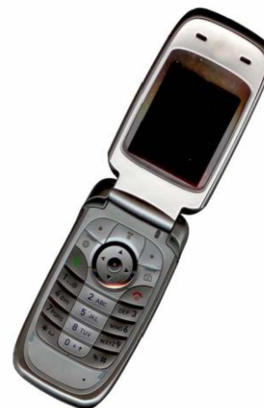
Fig. 3 Example of an image with acceptable resolution