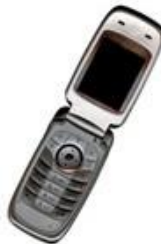
Fig. 2 Example of an unacceptable low-resolution image

must be placed after their associated figures, as shown in Fig. 1.